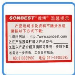
Warm Reminder Card