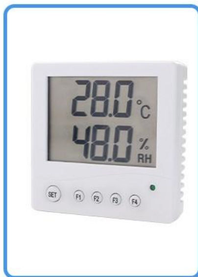
SD5110B (No Power Supply)