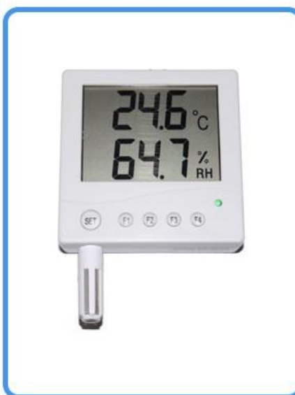
SD5111B (No Power Supply)