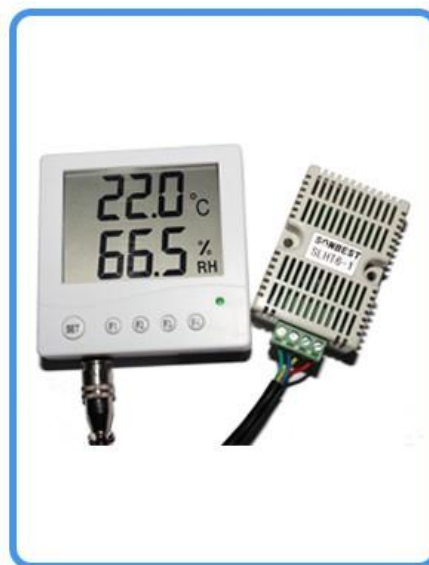
SD5112B (No Power Supply)