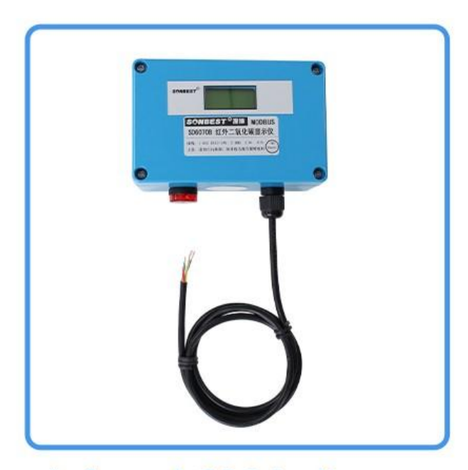
Infrared CO2 indicator