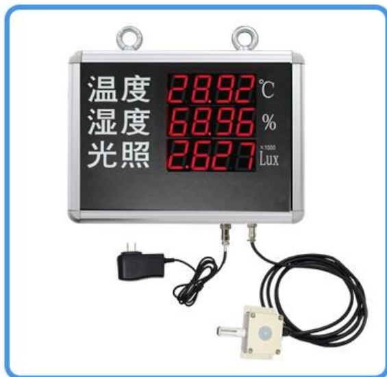
A set of signage (including power supply and sensor)