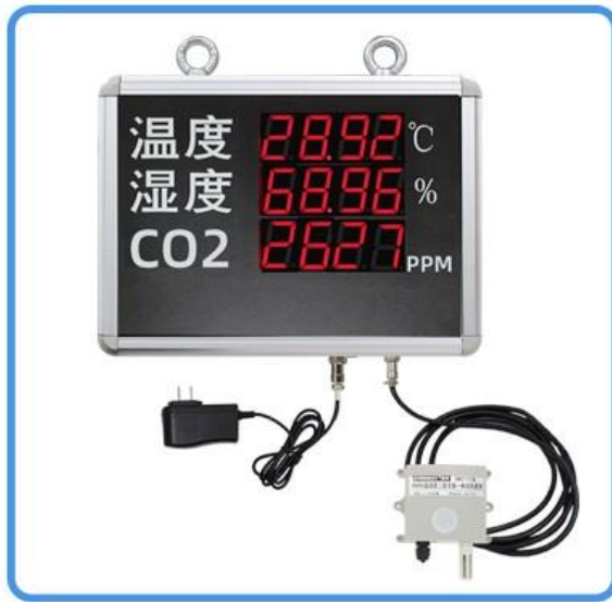
A set of Kanban (including power and sensors)