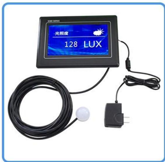
Color screen 200,000 range illuminance display