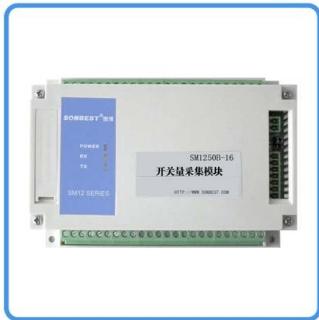
Switching acquisition module