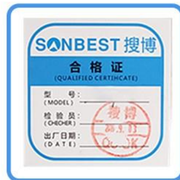
Certificate of conformity