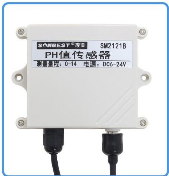
Liquid pH sensor (no converter, no power supply)