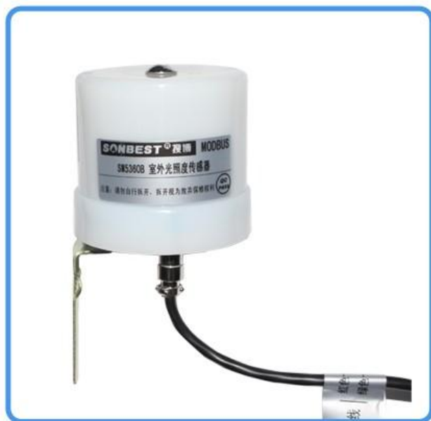
Outdoor illuminance sensor (No power supply, no converter)