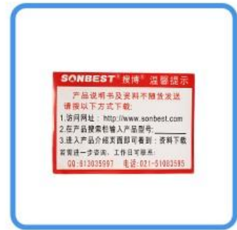
Warm reminder card