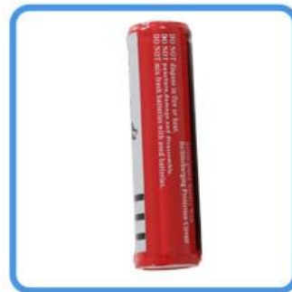
18650 lithium battery