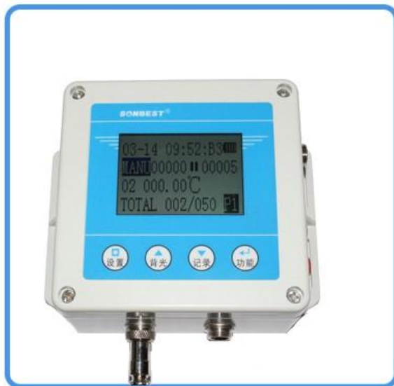
Recorder (including charger)