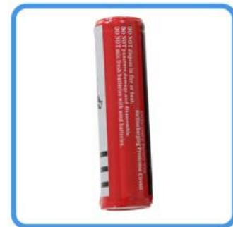
18650 lithium battery