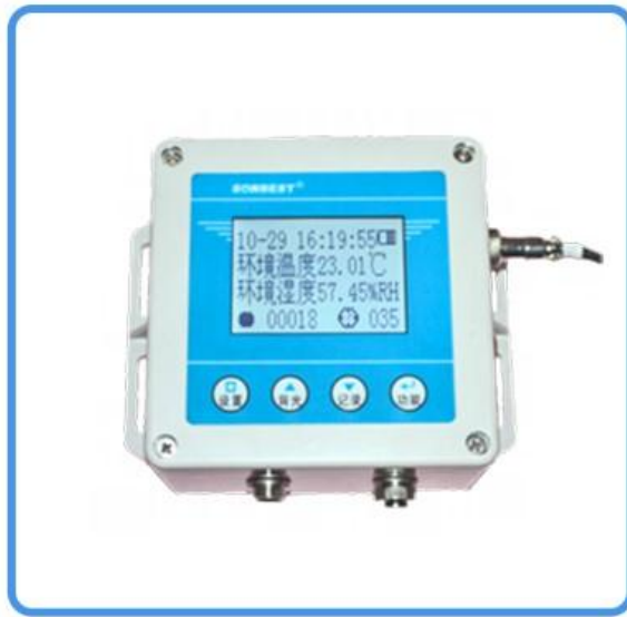
RS485 interface temperature and humidity recorder