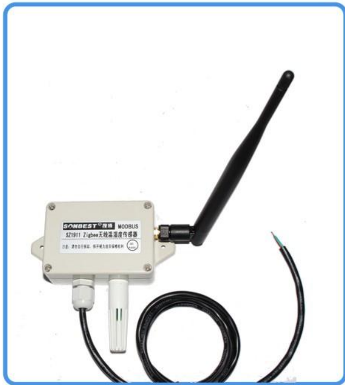
ZIGBEE wireless temperature and humidity sensor