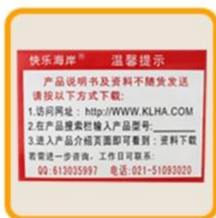
A reminder card