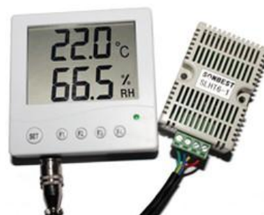
QD5112B (Power supply not included)