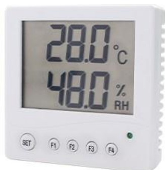
QD5110B (Power supply not included)