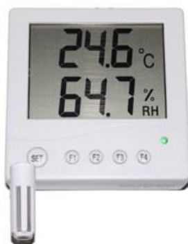
QD5111B (Power supply not included)