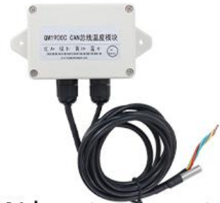
CAN bus temperature module