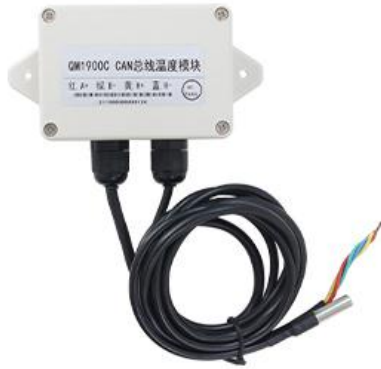
CAN bus temperature module