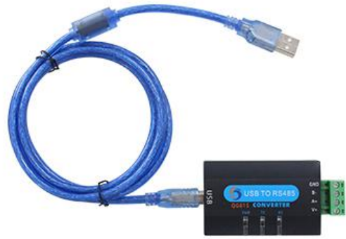
Isolated USB-485 converter

Connect to computer to transmit measurement data