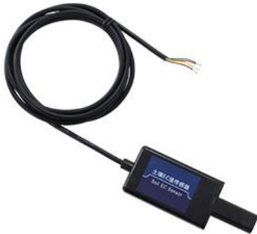
Soil EC value sensor