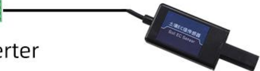
Soil EC value sensor