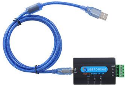
Isolated USB-485 converter

Connect to computer to transmit measurement data