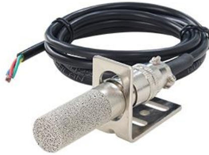
CAN bus protection temperature and humidity sensor (Without any other accessories)