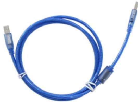
USB adapter cable