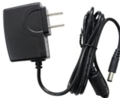
9V power cord