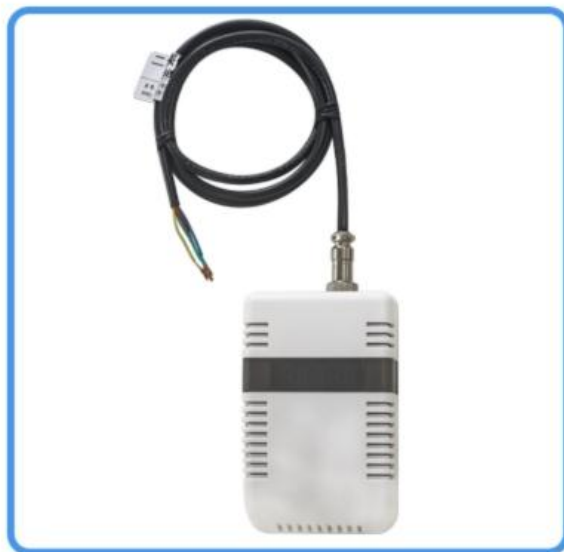
Carbon dioxide sensor