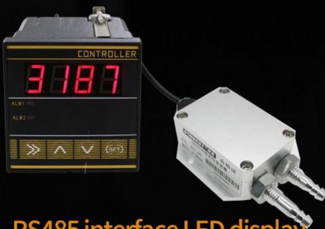
RS485 interface LED display differential pressure controller