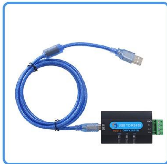
Isolated USB-RS485 converter (According to the user matching delivery)