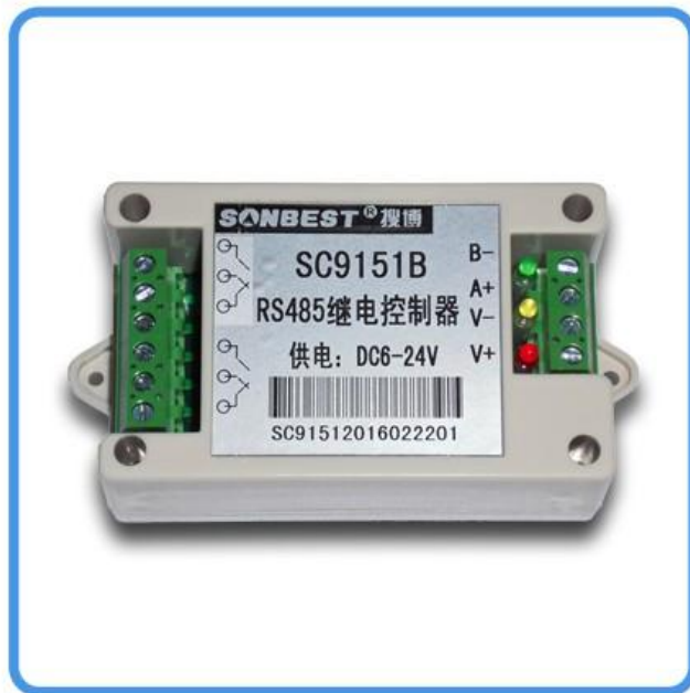
RS485 relay controller