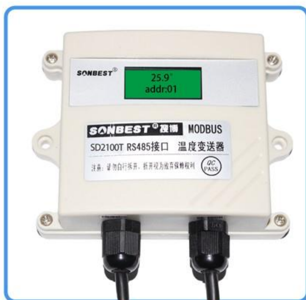
Network interface temperature collector