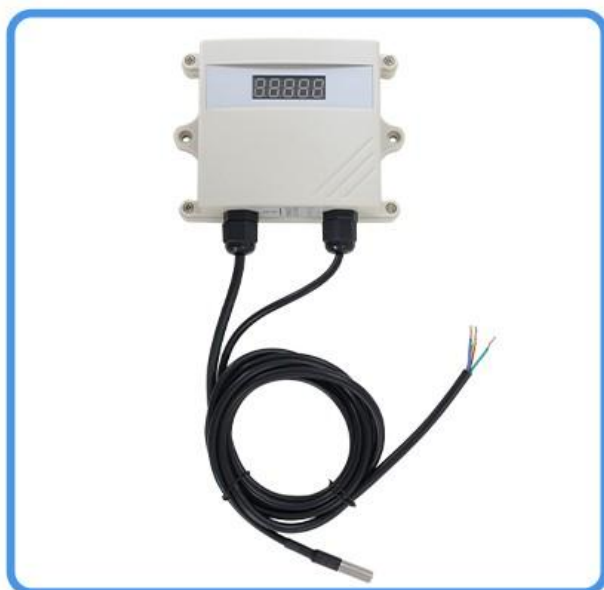
PT100 temperature indicator (No power supply, converter)