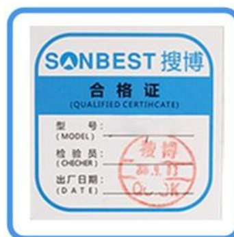
Certificate of conformity