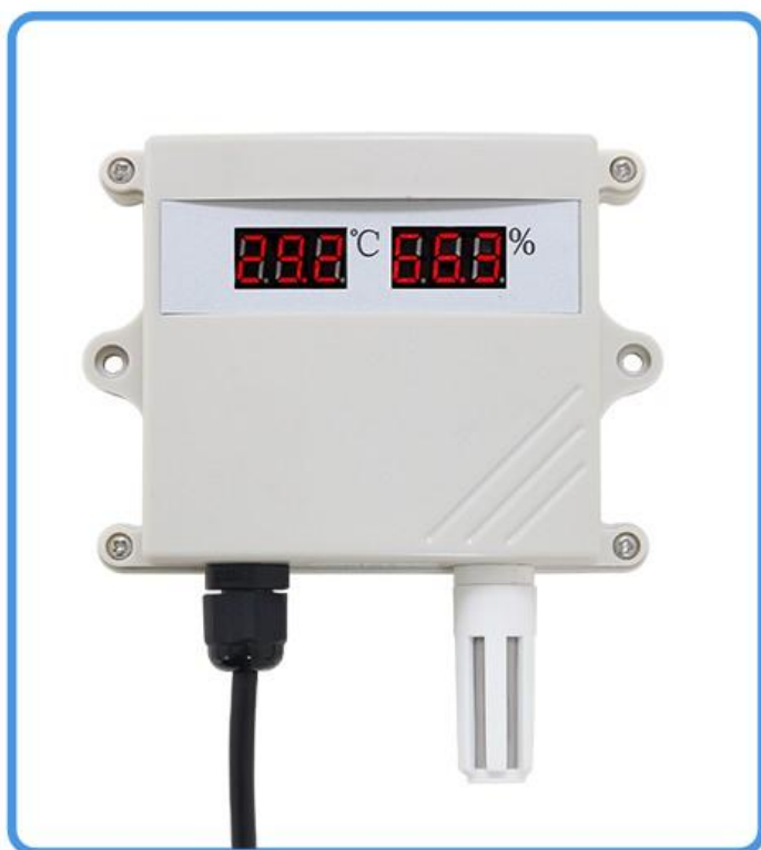
SD2113B temperature and humidity sensor (Without converter)