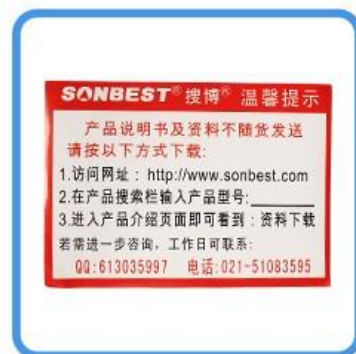
Warm reminder card