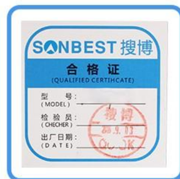
Certificate of conformity