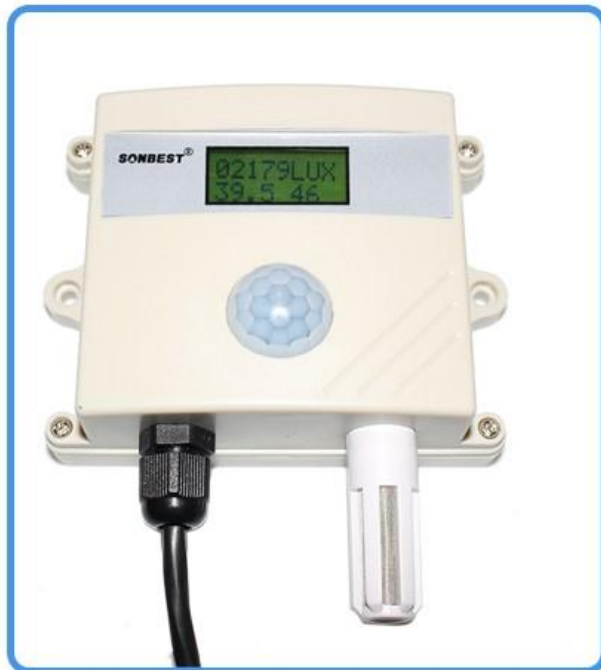
RS485 illuminance and temperature and humidity three-parameter display