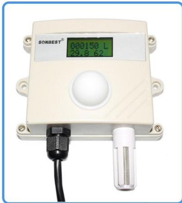
Illuminance, temperature and humidity are integr ated sensor