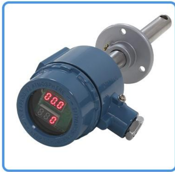
LED high temperature duct wind speed sensor