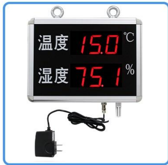
instrument (including DC12V 1A power supply)