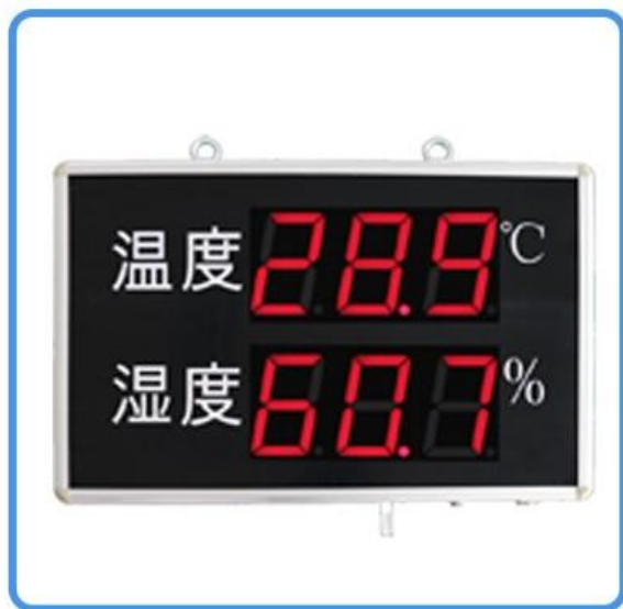
Temperature board (including power supply and network cable)