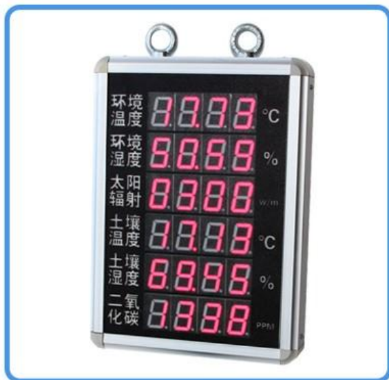
A set of Kanban (including power and sensors)