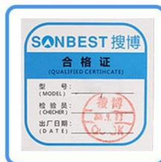
Certificate of conformity