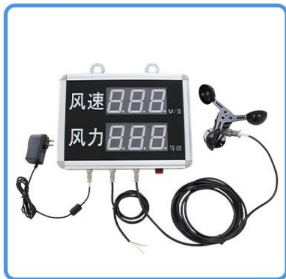
Large screen LED wind speed alarm (Including power supply, sensor, display)