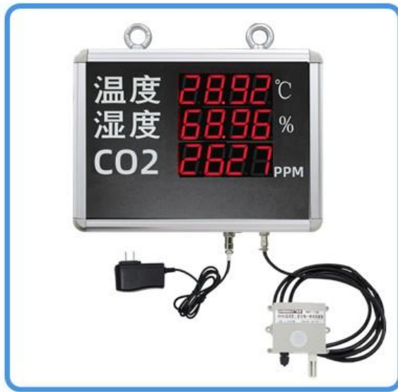
A set of signage (including power supply and sensor)