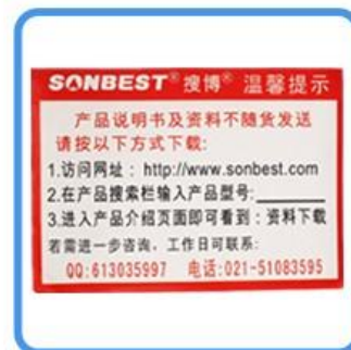
A reminder card