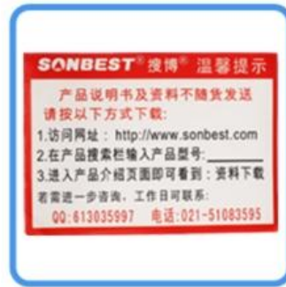
A reminder card