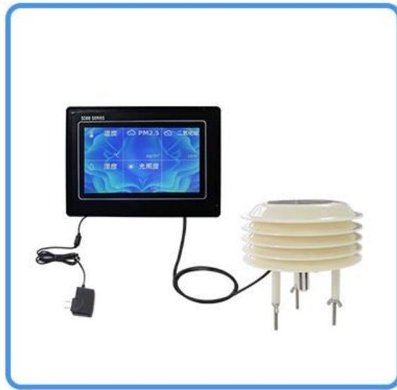
Color screen display with louver box