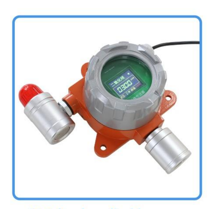
Metal carbon dioxide sensor (No power supply, converter)