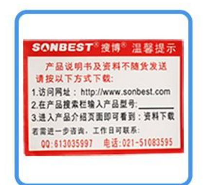
Warm reminder card