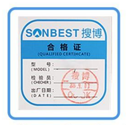
Certificate of conformity