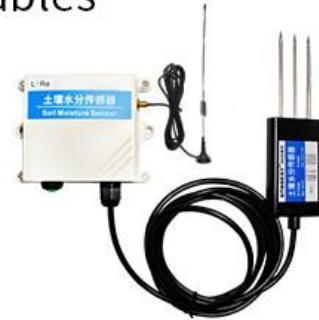
LORA soil moisture sensor