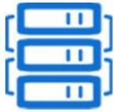
Control the device