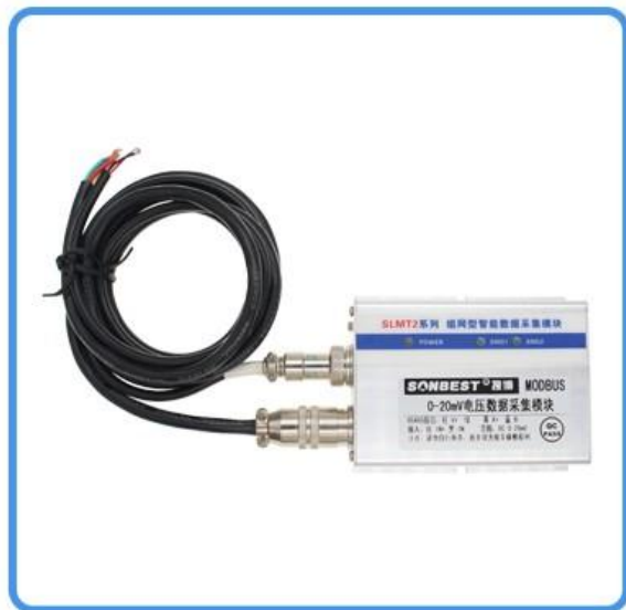
RS485 voltage 20mv acquisition module