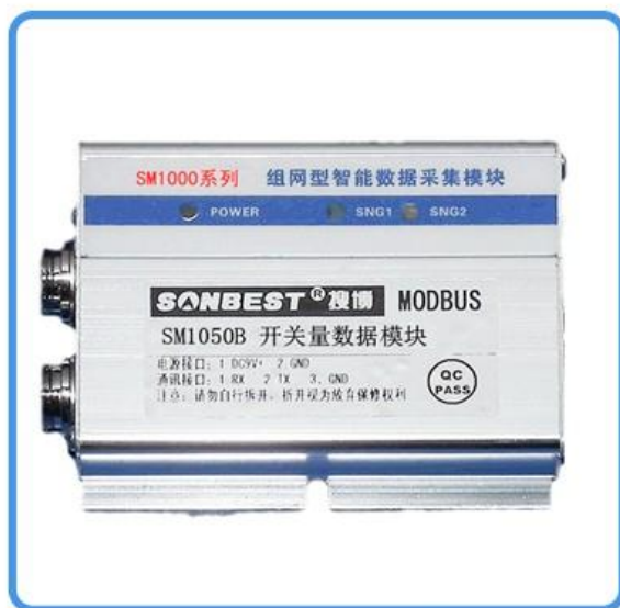
RS485 interface switch acquisition module