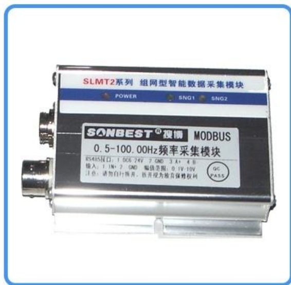
100Hz frequency wind speed data acquisition module