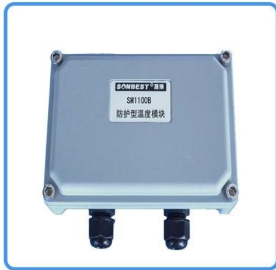
SM1100B Protective Temperature Module