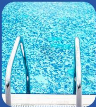
NO.1 Water quality testing

Turbidity sensors can be widely used in water quality testing and food testing, Washing machines, scientific research, aquaculture, laboratory, chemical and other environments.