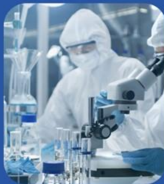
NO.5 Scientific research