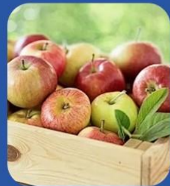
NO.3 Food testing