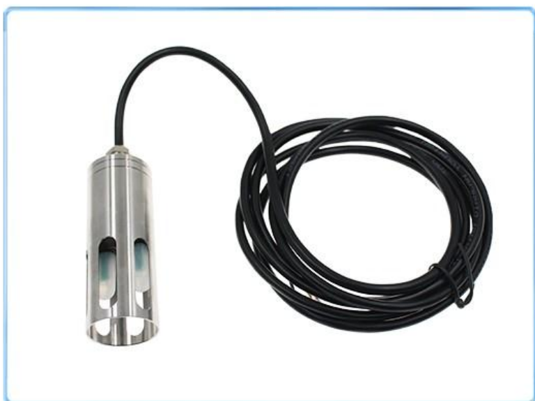
1 turbidity sensor (The actual delivery is subject to the user's selection)