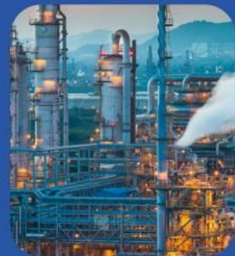
NO.6 Chemical industry