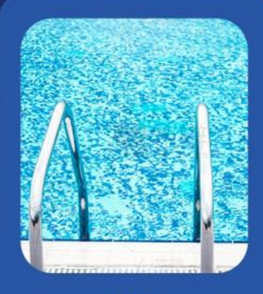
NO.1 Water quality testing

Turbidity sensors can be widely used in water quality testing and food testing, Washing machines, scientific research, aquaculture, laboratory, chemical and other environments.