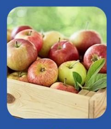
NO.3 Food testing