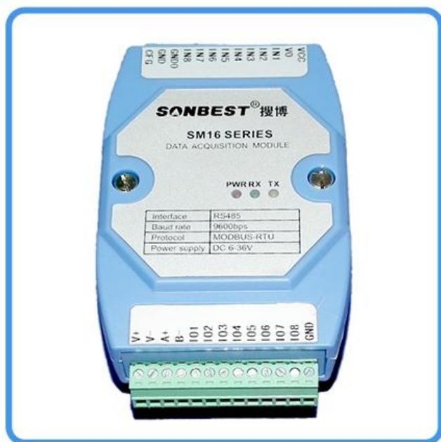
Eight-way switching acquisition module