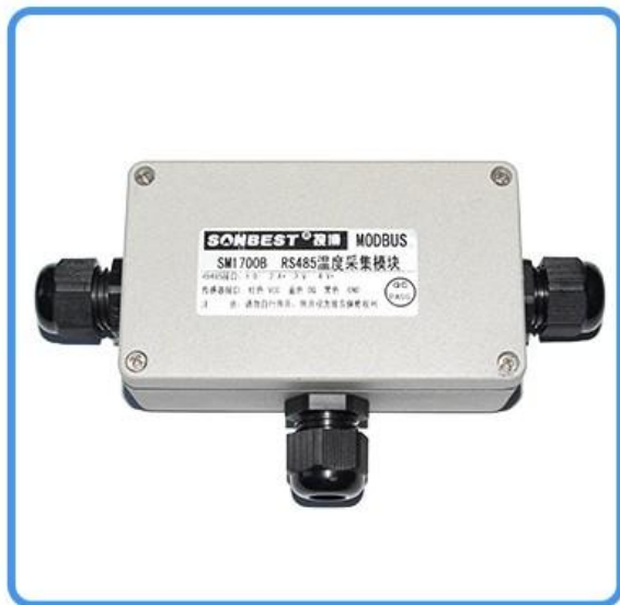
SM1700C CAN intelligent temperature data acquisition module