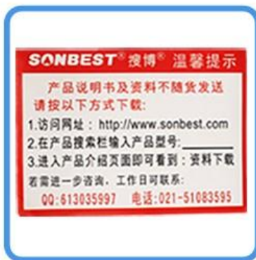
Warm reminder card