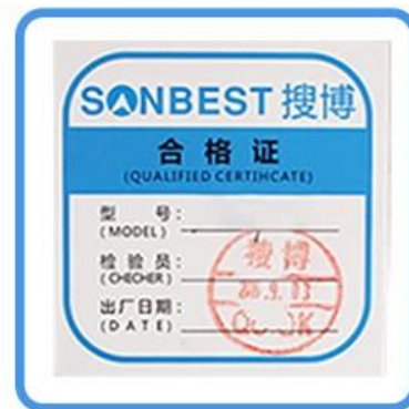
Certificate of conformity