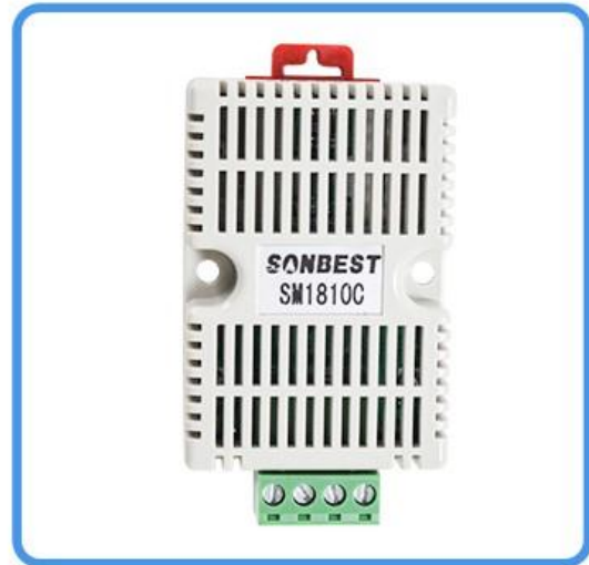
Single T / T&H acquisition module (Without converter)