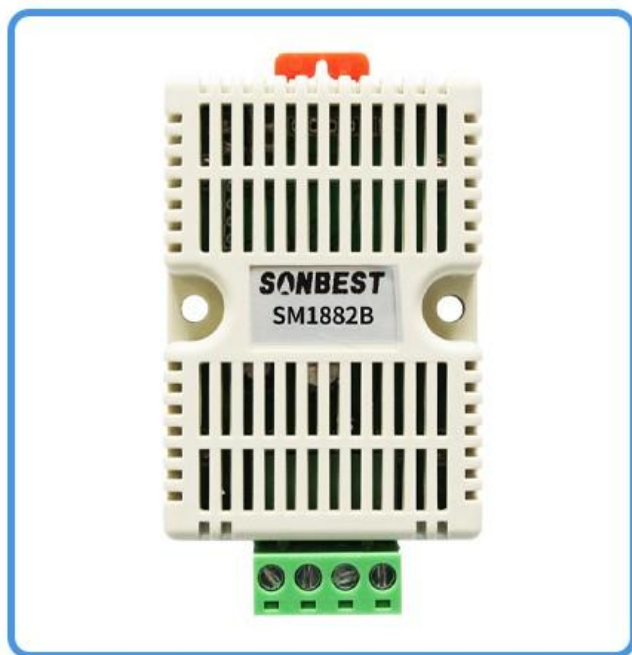
Barometric pressure sensor (No converter, no signal line)