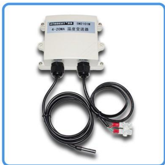
Protective type 4-20mA temperature PT100 current transmitter